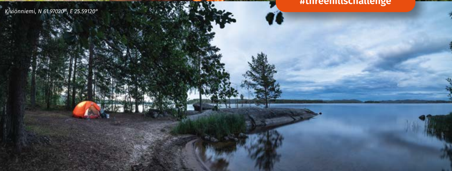
Kiviönniemi, N 61.97020°, E 25.59120°